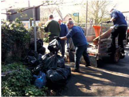
Big Firbeck Clean Up Underway

regularly use the bus to meet, chat, choose and order books as well as using the expert knowledge provided by the librarians. Firbeck Readers Group always get their readers sets through this facility. I, for one, would miss the mobile library and am conscious that, as I get older, I will find it more difficult to get to Maltby library especially as there are no longer buses going in that direction.