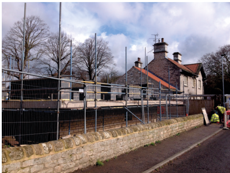
Homes Taking Shape Beside the Black Lion

Read more about the history of the Firbeck and Letwell ladies inside FLAG.