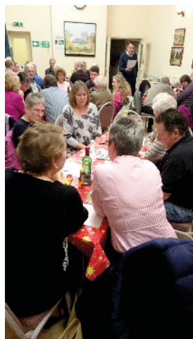
Eggheads at Work